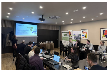
(Above) LEASP works with their regional stakeholder group to identify good practices for sustainable tourism in Slovenia

In Slovenia, DETOCS Lead Partner, Local Energy Agency Spodnje Podravje (LEASP) , has highlighted the “One-Stop-Shop (OSS)” for renewable energy as a DETOCS-endorsed best practice, showcasing how centralised support can accelerate renewable energy investments. Established to address administrative complexity and lack of clear information, the OSS streamlines processes for individuals, businesses, and municipalities. Managed by Borzen and supported by 36 advisory offices, the OSS provides free expert guidance, reducing bureaucracy and boosting investor confidence. In its first phase, it aims to deliver 1,400 advisory sessions, with 60% of advised investors expected to proceed with projects.