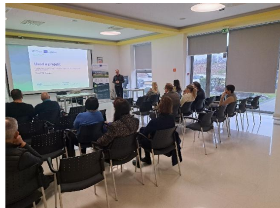
Date: 4 th February 2026 Location: Kukuljanovo, Croatia